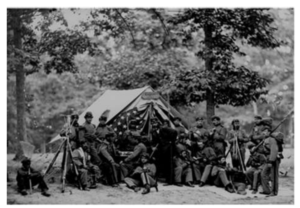
Engineers of the 8th New York State Militia in front of a tent, 1861

"One newspaper noted that 'by memorializing the great ... hero of the Army of Northern Virginia," the research paper said, "The War Department shrewdly took the measure of local responsibilities" and the "Army appealed to a vein of patriotism no self-respecting Virginian could be without." The newspaper noted the local community saw "no controversy" in the decision.