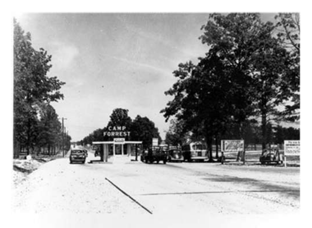
The entrance to Camp Forrest in Tennessee.

of staff, who urged that "the desires of the State authorities will be followed unless it is found that the name selected is unsuitable for psychological or other reasons."